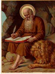
St. Jerome Priest, Confessor, Doctor of the Church September 30

Jerome, born at Stridon in Dalmatia, was baptized at Rome as a young man and studied the liberal arts with Donatus and other very learned men. In the service of religion, he traveled all over Palestine. Then he retired to the vast Syrian desert, where he spent four years in reading Sacred Scripture and in the contemplation of the blessedness of Heaven. Ordained priest by Paulinus, bishop of Antioch, he went back to Palestine. There, near the crib of the Lord Christ in Bethlehem, he led a life patterned after that of Heaven itself. He conquered the wiles of the devil with works of devotion and continual reading and writing. Questions on Holy Scripture were referred for explanation to him as to an oracle, being sent to him from all over the world. Pope Damasus and St. Augustine often consulted him on difficult passages in Scripture because of his singular learning and his knowledge not only of Latin and Greek but also of Hebrew and Chaldaic. He translated the Old Testament from the Hebrew; and, by command of Pope Damasus, he revised the translation of the New Testament to make it faithful to the Greek text and explained a great part of it. His body was buried at Bethlehem and later taken to Rome and buried in the basilica of St. Mary Major.